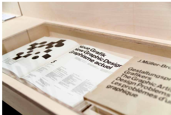
detail exhibits of Swiss Typography

The exhibits are virtually complemented by interactive facilities, with screens inviting visitors to browse. However, current positions from Typo-Insider magazines are also on show and can be discussed in workshops, which are offered as part of the extensive companion programme.