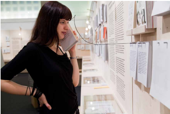
“talking book” taken literally

Furthermore, the origin of the term “talking book” is taken literally here, with “Texts on Typography” from specially selected books which are presented for the listener.