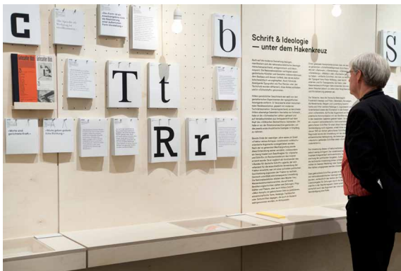
view of wall processing