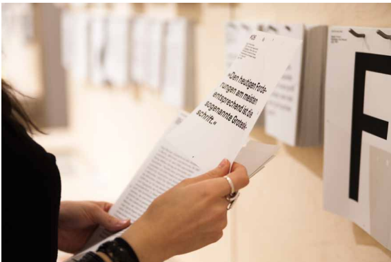
“Texts on Typography”

The frequency with which our team has to replenish the tear-off quotations and type examples shows that the balancing act has come off: to reach the interested lay person as well as the professional, hoping that they will allow themselves to be charmed by typography – which is the objective of the exhibition.