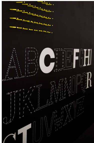
details children's area