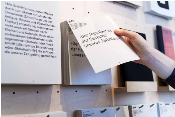
stubs to take

Spendenkonto: Sparkasse Mainz BLZ: 550 501 20, Konto Nr.: 331 Hhst. 1.3210.1785002