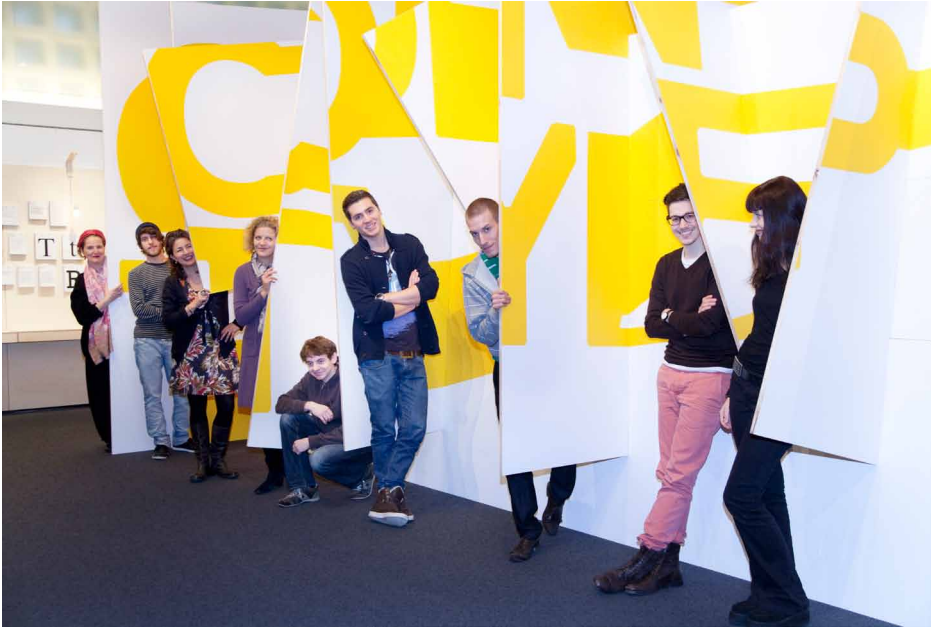
curators and exhibition team

Gutenberg-Museum Mainz Weltmuseum der Druckkunst