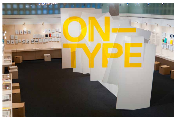
view into the exhibition

Bright wall panels in minimalist design are offering succinct quotations and type examples on stubs which can be torn off, enabling visitors to compile their own catalogue.