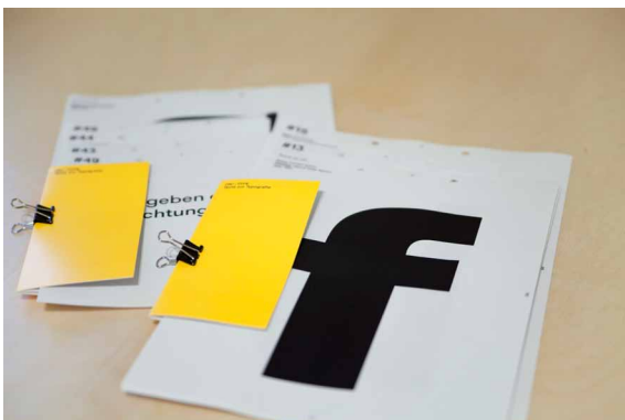
individual do-it-yourself exhibition catalog