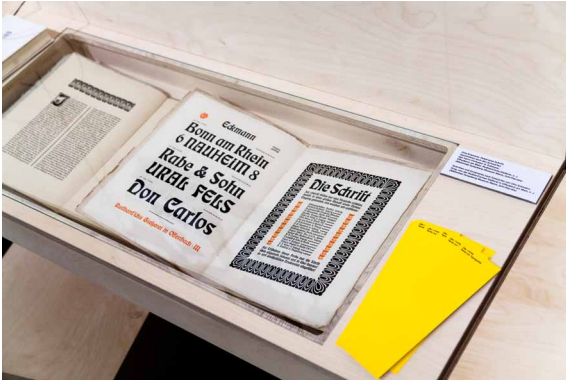
detail exhibits Jugendstil (Eckmann)